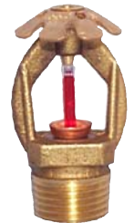
QUICK RESPONSE CONVENTIONAL