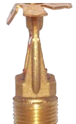
QUICK RESPONSE VERTICAL SIDEWALL