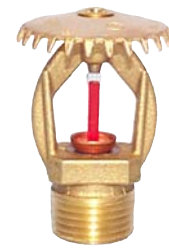
QUICK RESPONSE UPRIGHT