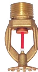
QUICK RESPONSE PENDENT